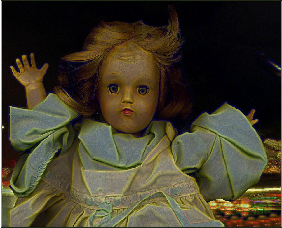
– Pris Cambell