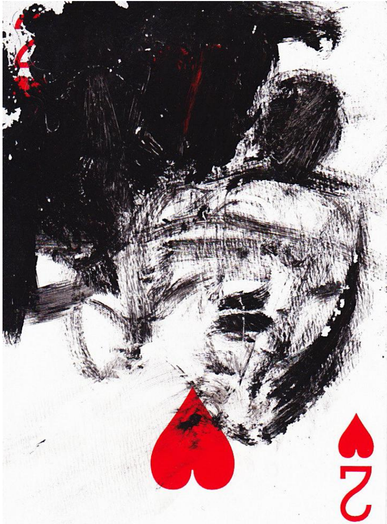
- Dustin Holland